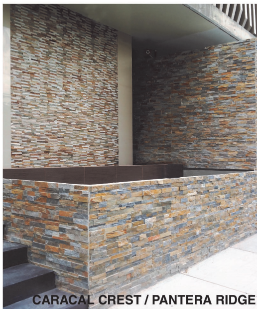
CARACAL CREST / PANTERA RIDGE