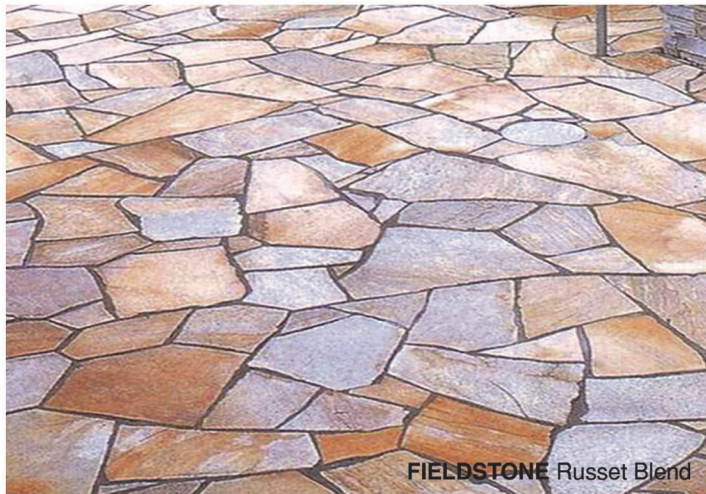
FIELDSTONE Russet Blend